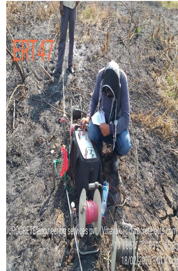
Electrical Resistivity Test