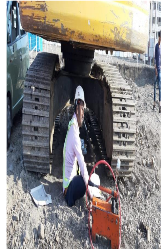
Plate Load Test