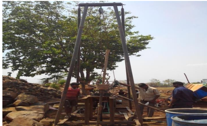
Calyx/Hydraulic Drilling Rig/SPT